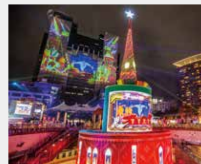
2020 Christmasland in New Taipei City Profile Photo

will serve as a meaningful check-in spot for all visitors.