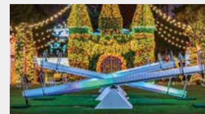
2020 Christmasland in New Taipei City Profile Photo

We will also decorate the footbridges around City Hall with colorful and artistic lighting. You should definitely check it out. We have created a lighting show on one of the bridges to promote “gender equality.” This brilliant footbridge is a tribute to “women’s right” and