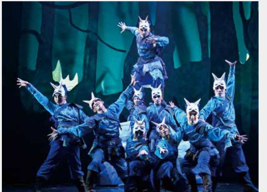
2022 New Taipei City Children's Arts Festival— Monster Universe

Have you checked out the "New Taipei" and enjoyment this summer? Why not join us City Children's Arts Festival - Monster and explore the monster universe! Universe"? Our hot and popular "Monster Universe" is stationing in Civic Square until August 7th. What's more, our online universe will keep you company until August 14th! Are you looking for more fun